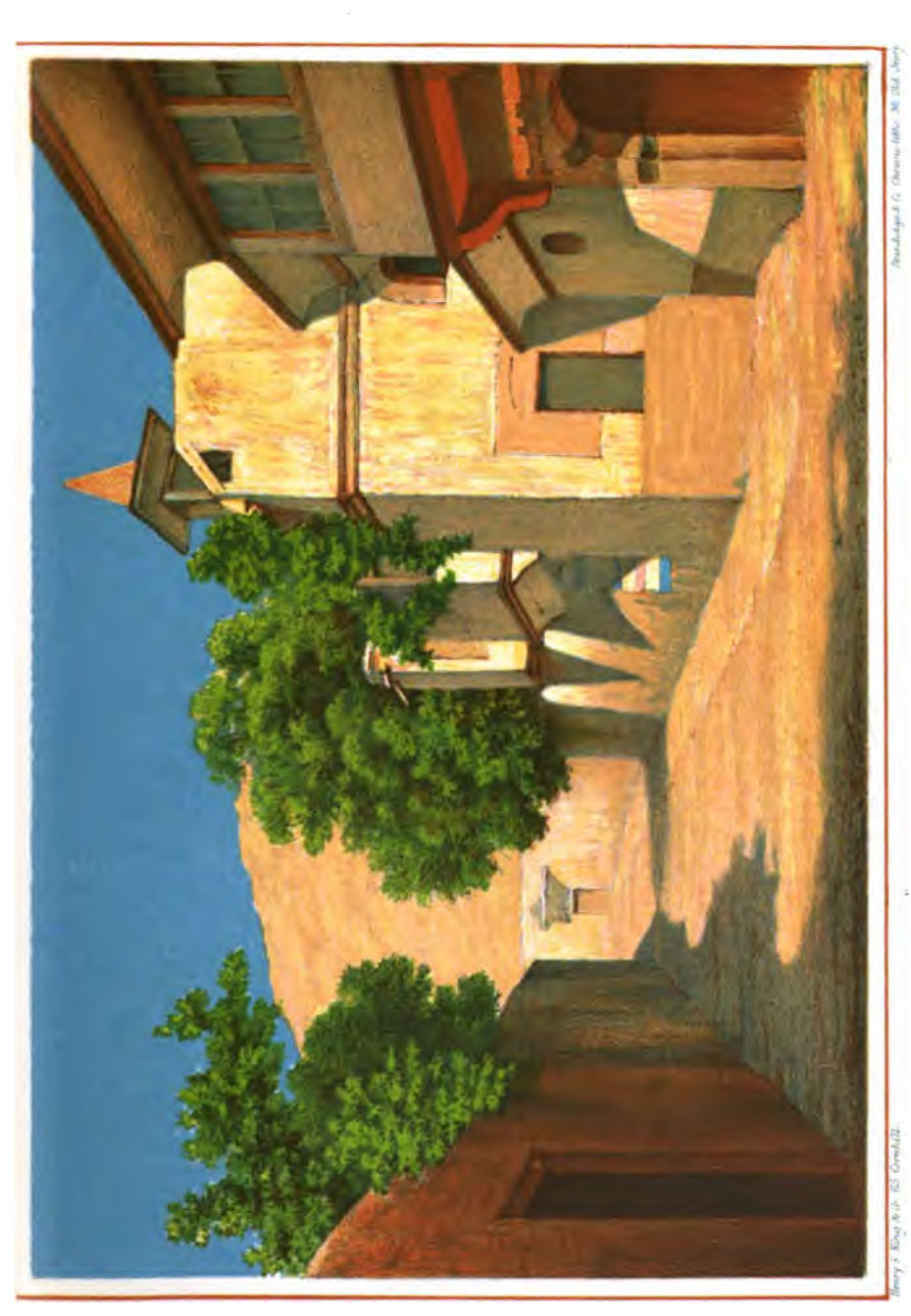
CAPT* BURTON'S HOUSE AT SALAHIYYEH UNDER JEBEL KAYSUN (From a Bainting by Frederic Leighton RA)