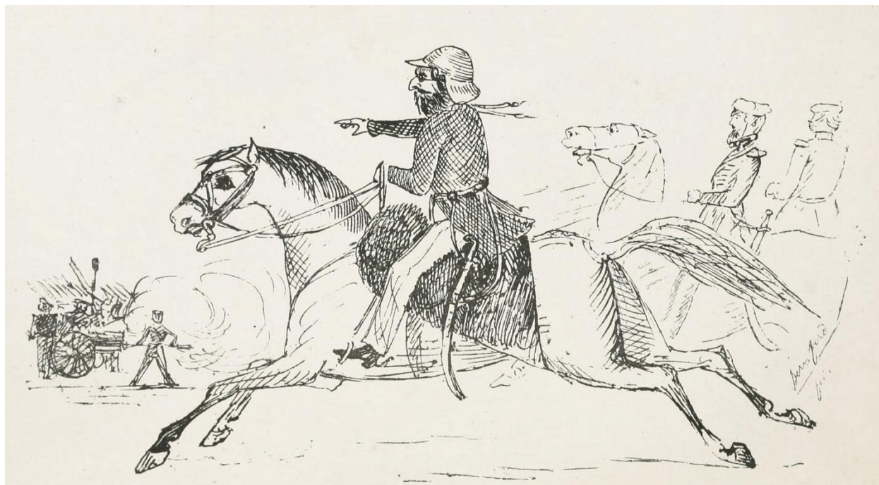
Figure 5. General Sir Charles Napier. 45

The paper which printed Rathborne's bombshell letters to greatest effect was the British Indian Gentleman's Gazette and Bombay Daily Advertiser , 46 in late September or early October of 1845. The frank statements in it about the Amirs and the brothels started a furor. The counter-attack was led by the Bombay Times , which had been fulminating about the Kurrachee Advertiser in general for some time, but was now driven to florid indignation, curiously qualified by some hedging about the guilt of the Amirs: 47