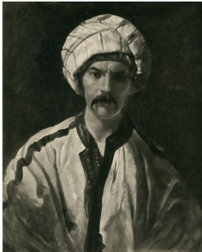
Figure 3. Burton in Native Dress in the 1840s.