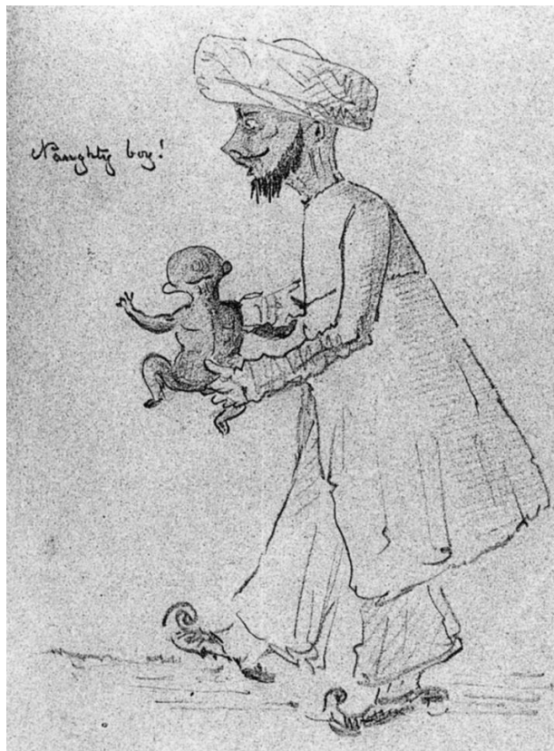
Figure 2. Caricature attributed to Burton.

Brodie also appended a footnote that suggested she had made extensive but fruitless efforts to locate the report itself, through the director of the India Office Records in London, who requested a search on her behalf; the Bombay Records Office in Delhi, which requested a similar search with no more luck; and the Records of the Government of West Pakistan (as it was then called) in Lahore, which found nothing either. 23 But those who have conducted research in archives will recognize how unlikely it is that this kind of ‘searching’—remote, delegated, at third-hand or worse, and not by specific subject domain experts—will ever turn up anything useful. No conclusions can be drawn from Brodie’s failure to find the report in this way, though it is striking that she appears to have been the first person to make any sort of effort at all.