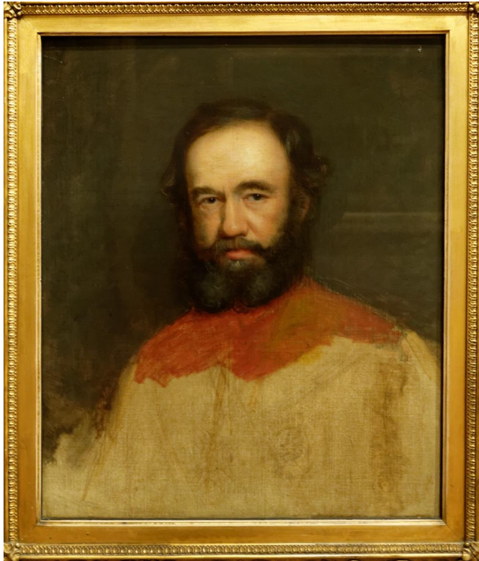
Figure 6. General Sir James Outram (1803-1863). 57