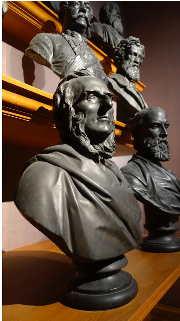
Figure 4. Bust of General Sir Charles Napier. 41

Napier's brother William Francis Patrick 39 acted as his proxy in the propaganda war that ensued, as accusations and counter-accusations were traded about the rights and wrongs of the annexation, Napier's conduct, and whether or not the colony would pay for itself. 40 The controversy was partly about the Amirs—sometimes called Mirs or Ameers—the former rulers who had been deposed by Napier after he had defeated them on the field of battle at Miani in 1843.