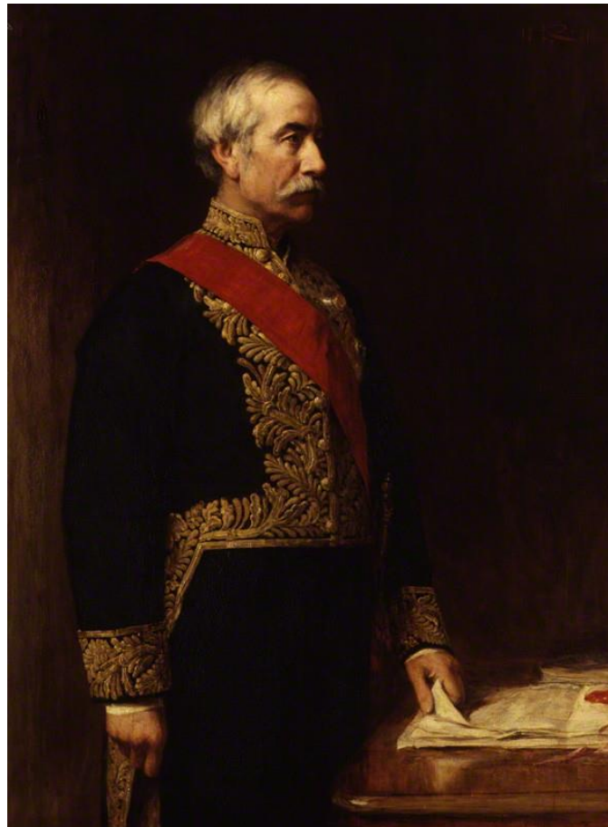
Figure 7. Sir Henry Bartle Edward Frere in 1881. 65